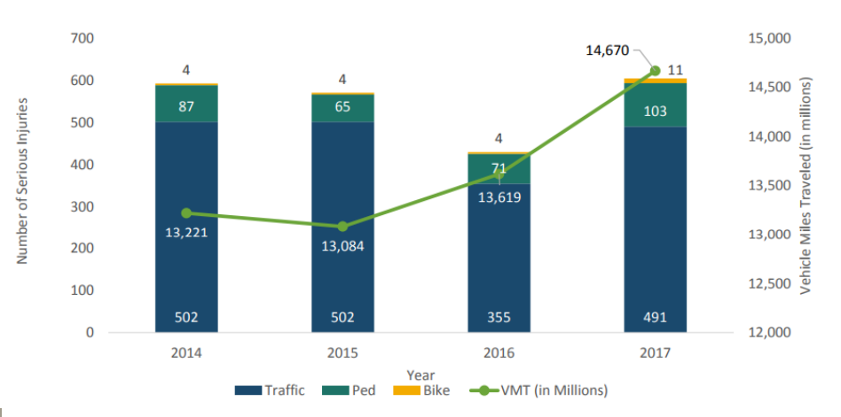
Chart 3.4.3: Q1 Comparison of Traffic-Related Serious Injuries CY2014-CY2017