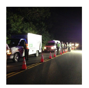
Sobriety checkpoint during Labor Day holiday weekend in Allegany County .

However, as the authors point out, enforcement needs to be done right. It should be data and purpose driven, place-based and legally sound. In Maryland, we combine such enforcement with targeted education in our High Visibility Enforcement model. The Maryland Highway Safety Office is a solid partner for providing the data and education – as well as grant support – for effective HVE efforts.